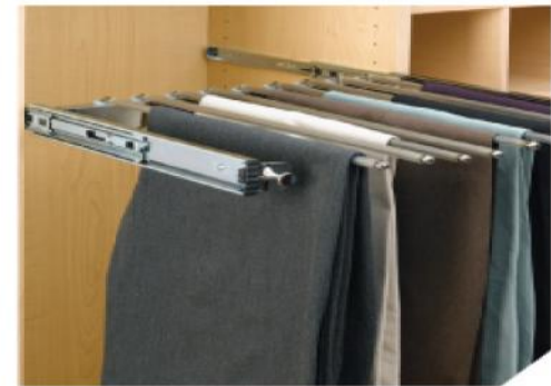
Pulloput Trouser Hanger