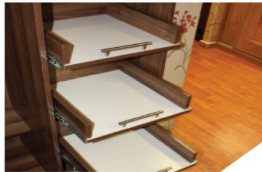
Pull Out Shelves