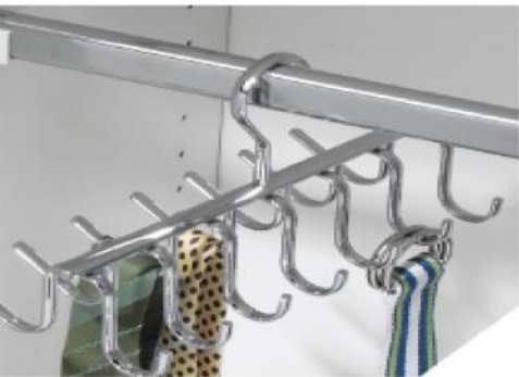
Tie Belt Rack